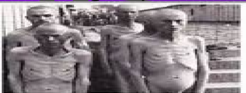
Emaciated inmates of Auschwitz concentration camp, 1940's (Image from the Holocaust) www.HolocaustResearchProject.org