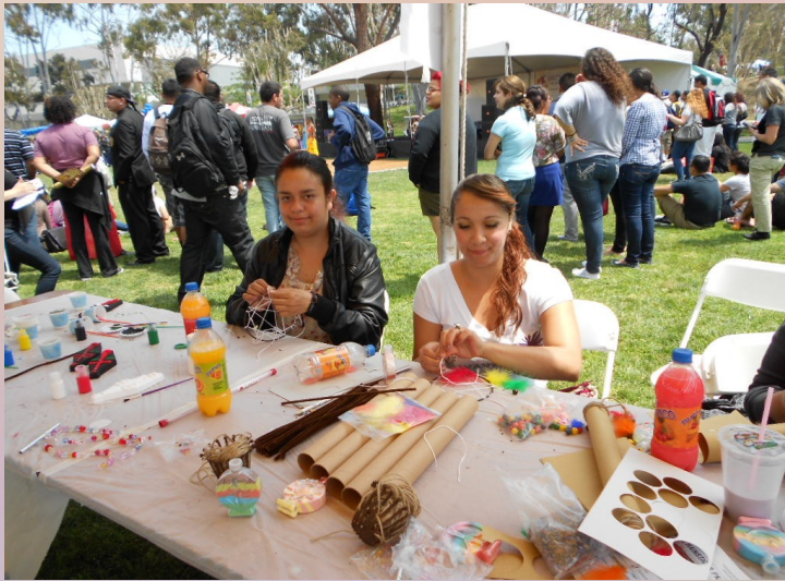
CSUDH Law Fair, Spring 2012

Before participating in the TIIP Grant, our SDC-Mild/Moderate students were not attending field trips. They weren't even being invited.