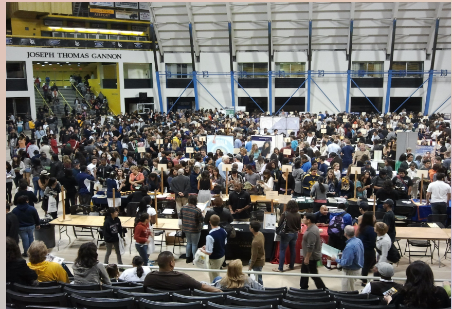
College and Career Night at the Pyramid, CSULB-Nov 2011 and November 2012